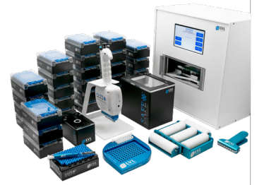
Starter Pack Complete