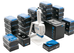
Starter Pack Large