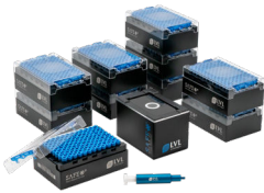
Starter Pack Small

The SAFE® Starter Packs are ideal for laboratories looking to optimize their sample storage while keeping an eye on costs. With the included SBS racks, you can organize your samples efficiently and in a space-saving manner. Our tubes are suitable for extremely low temperatures down to -196^{\circ}\text{C} (LN 2 ) and offer the highest levels of security and identifiability for your samples.