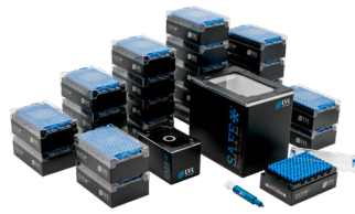
Starter Pack Medium